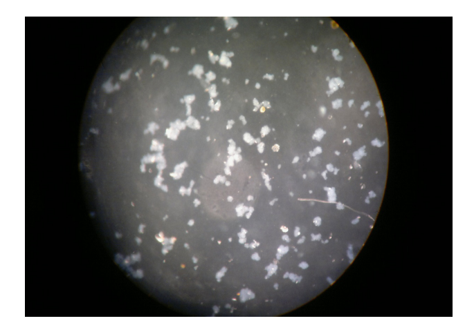
Fig. 1: Microphotograph showing positive titre ( \geq 1:100) of microscopic agglutination test (MAT) for Leptospira in a dog affected with renal failure